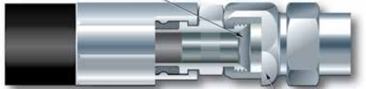
Robust swivel joint allows for maximum torque

Up to 24,000 psi burst pressure (~16 size G6K)