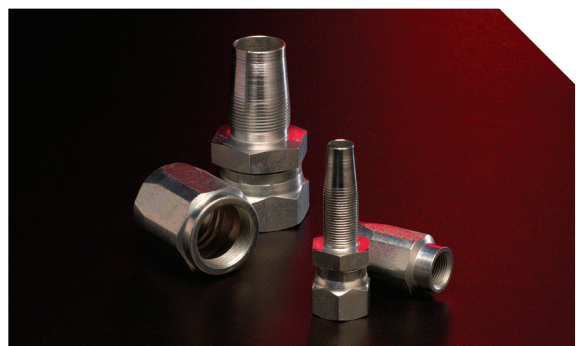
Gates C5CXH hose assemblies can use either field attachable or permanent crimped couplings.

In addition, C5CXH hose can accommodate either field attachable or permanent crimped couplings. The blue polyester/textile cover is resistant to deterioration from oil and mildew for long-lasting life. The hose is compatible with both petroleum and phosphate ester fluids. Consult with Gates Application Engineers for suitable levels of phosphate ester concentration.