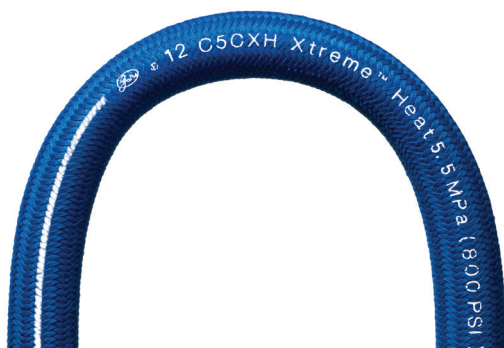
The minimum bend radius for Gates C5CXH hose exceeds the SAE standard, offering superior flexibility.

Gates C5CXH provides a minimum bend radius specification that meets or exceeds the SAE standard. That makes for easier installation and routing in crowded engine compartments, reduces the need for bent tube fittings, shortens hose assembly length, and extends hose life in bending, flexing applications. C5CXH is recommended for diesel fuel applications and has passed the tube fuel resistance requirements of SAE J30R2.